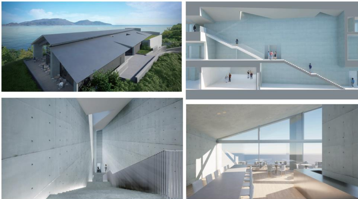
Rendered images of Naoshima New Museum of Art. © Tadao Ando Architect & Associates

Online tickets on sale from Friday, April 11, 2025