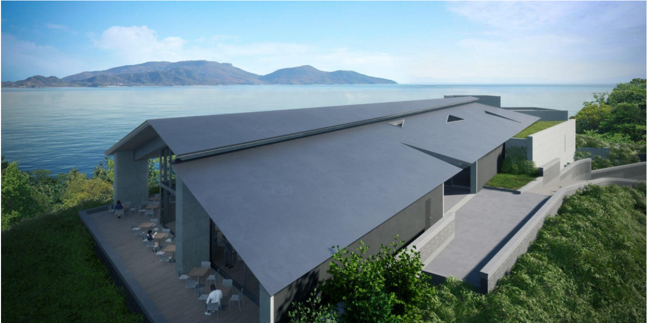
Rendered image of Naoshima New Museum of Art