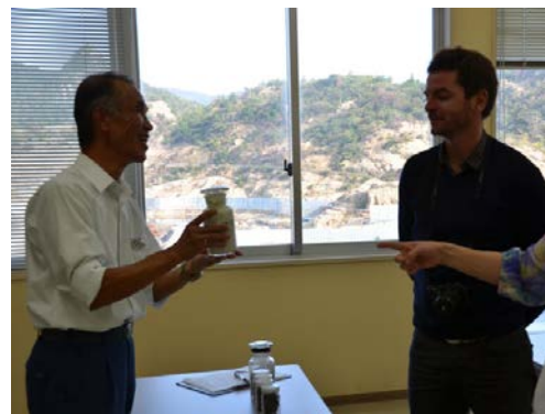
Sala on a tour of Teshima