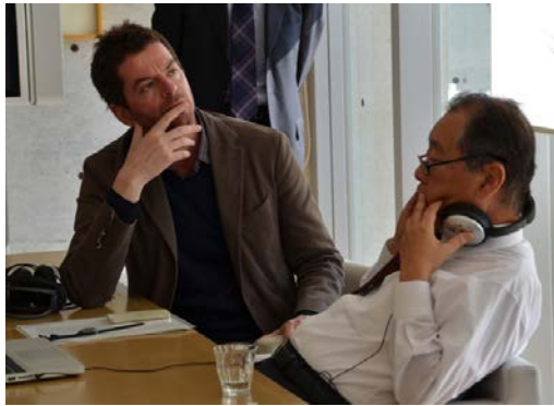
Sala takes part in a meeting on Naoshima